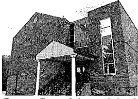
George Grant Mason School